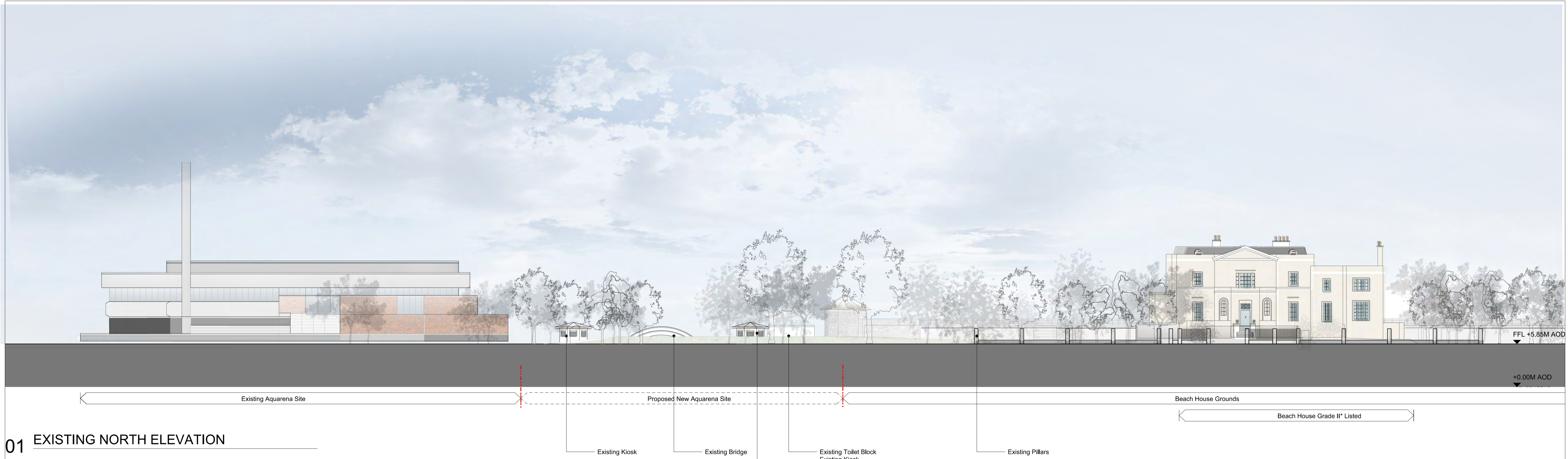
01 EXISTING NORTH ELEVATION