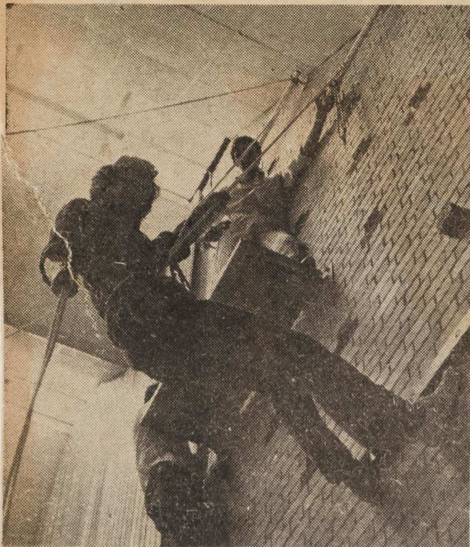
PUPILS from Boundstone Comprehensive School, Lancing, provided a demonstration on rock climbing in the main hall of the sports centre for the opening displays on Saturday.